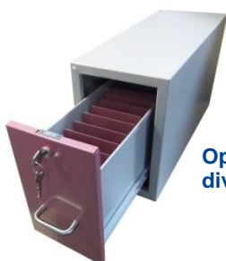
Open drawer showing metal dividers