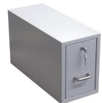
Light Grey RAL7035 prescription cabinet

Frame / drawer front colours. (Selected RAL/BS colours illustrated below).