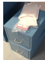
Pastel Blue prescription cabinet