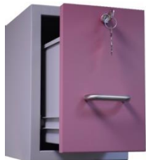
Light Grey frame with Lilac drawer front