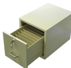
Sterling Grey finish

An all metal construction powder coated in a choice of 18 standard colours.