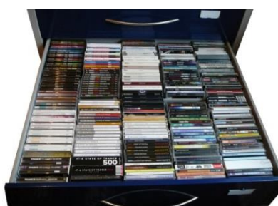
Figure 2: Open drawer with 5 rows