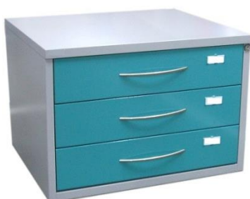
Figure 1: 3-drawer Light Grey CD cabinet